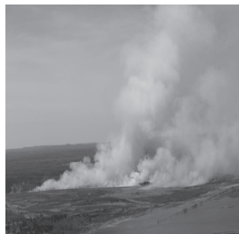
Aerial view from Pool 2 of PR27/OSR27 burn with silo area in foreground

majority of our priority burns for the season. This could not have been accomplished without the support of the Refuge Staff, adjacent Refuges, State cooperators and private contractors. Without support from the Necedah NWR, Leopold WMD, Trempealeau NWR, Upper Mississippi River Refuge, Wisconsin DNR, Region 3 FWS and AD hires we could not have accomplished the amount we have in this short amount of time. When you're out on the refuge in the next few weeks and see smoke rising from the air, you can be sure Fire Personnel from Necedah NWR and the surrounding area have things under control.