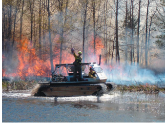
Marsh Master igniting sedge grass along northern boundary of SE Pool on Meadow Valley Flowage

From 4/12/2011 to 5/17/2011 the Necedah Fire Management Program has accomplished 10 prescribed fire treatments for 1924 acres. Eight of the treatments were performed on the Necedah NWR, 5 of which were considered Priority 1 treatments, totaling 1209 acres. In addition to Refuge priorities, the Fire Management Staff completed 1 priority treatment for 30 acres at the Trempealeau NWR and assisted the Wisconsin DNR with a 300 acre priority treatment on the Meadow Valley State Wildlife Management Area.